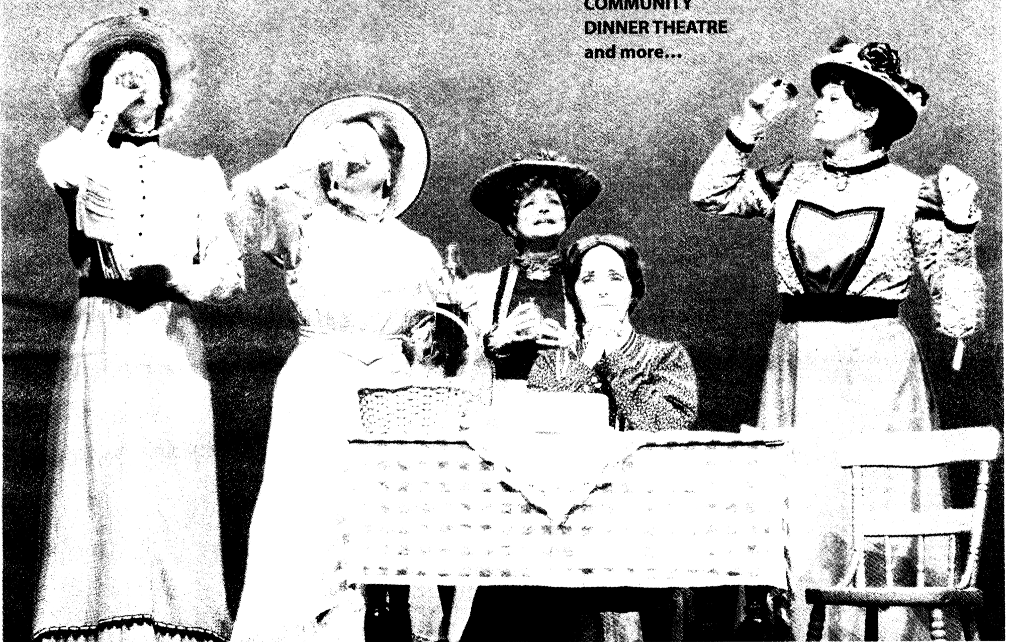
The ladies of Avonlea in the 2003 Charlottetown Festival production of Anne of Green Gables—The Musical™.